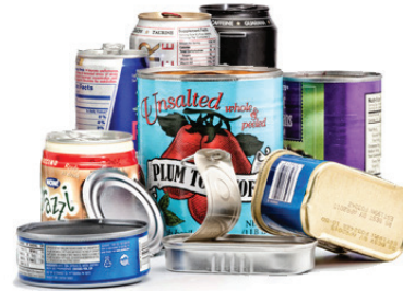
All Metal Beverage & Food Cans, Empty Aerosol Cans, Clean Aluminum Pans & Foil