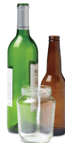
Glass Bottles & Jars (Even broken)