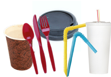
Paper Cups, Cup Lids, Plastic Utensils, Plastic Straws (Including compostable)