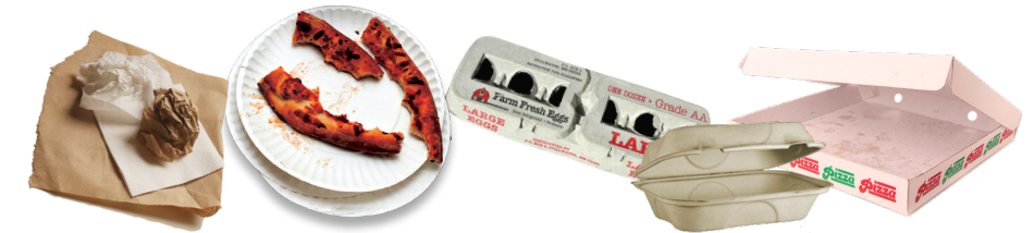
Food Soiled Paper, Napkins, Paper Towels, Pizza Boxes, Cardboard Egg Cartons, Non-coated Take-out Containers & Paper Plates (No surface sheen)