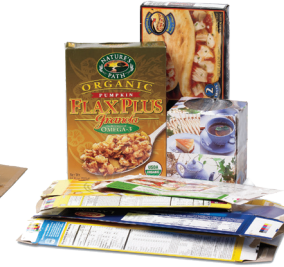
Clean Paper, Magazines, Newspaper, Cardboard, Junk Mail