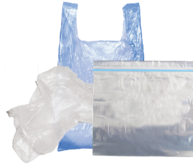
Plastic Wrap, Bags & Other Plastic Film