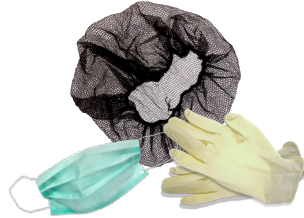
Disposable Gloves & Hairnets