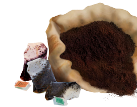
Coffee Grounds & Tea Bags