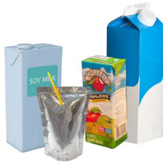
Drink & Beverage Cartons, Boxes / Pouches (Multi-material Packaging)