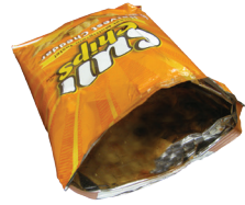
Snack & Chip Bags, Candy Wrappers

UPDATED: Milk cartons, coated paper (with surface sheen) such as cups, plates or cardboard boxes belong in trash only.