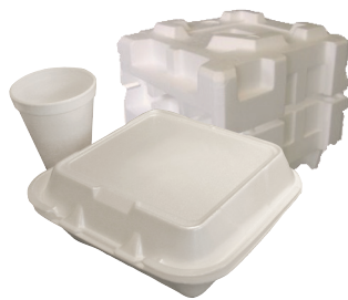
Polystyrene Foam & Packaging