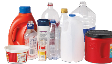
Empty Plastic Bottles, Rigid Plastic Containers (Lids should be left on or placed in trash)