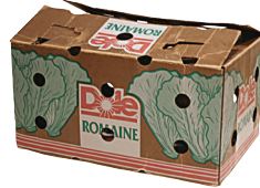
Wax-lined Food Cardboard Boxes