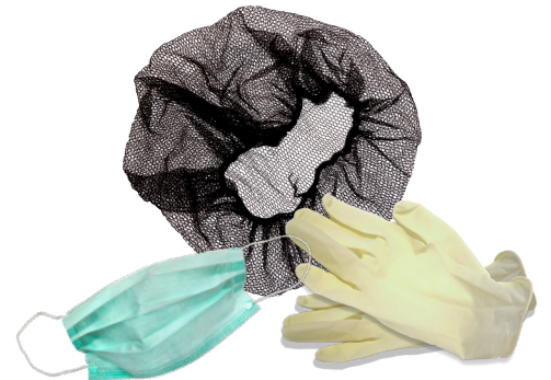
Disposable Gloves & Face Masks