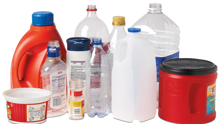
Empty Plastic Bottles, Rigid Plastic Containers (Lids should be left on or placed in trash)