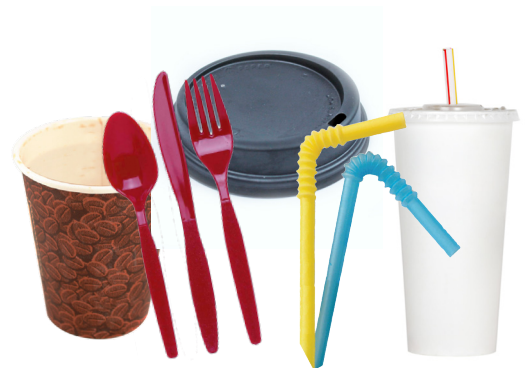
Paper Cups, Cup Lids, Plastic Utensils, Plastic Straws (Including "compostable" plastic serveware)