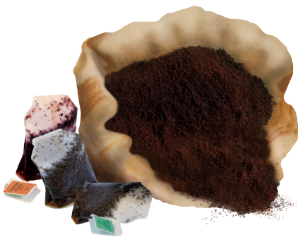
Coffee Grounds & Tea Bags