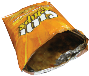
Snack & Chip Bags, Candy Wrappers

UPDATED: Milk cartons, coated paper (with surface sheen) such as cups, plates or cardboard boxes, belong in trash only.