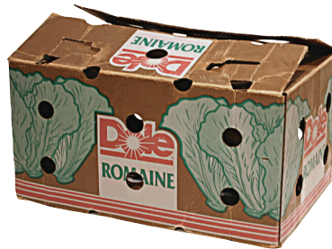
Wax-lined Food Cardboard Boxes