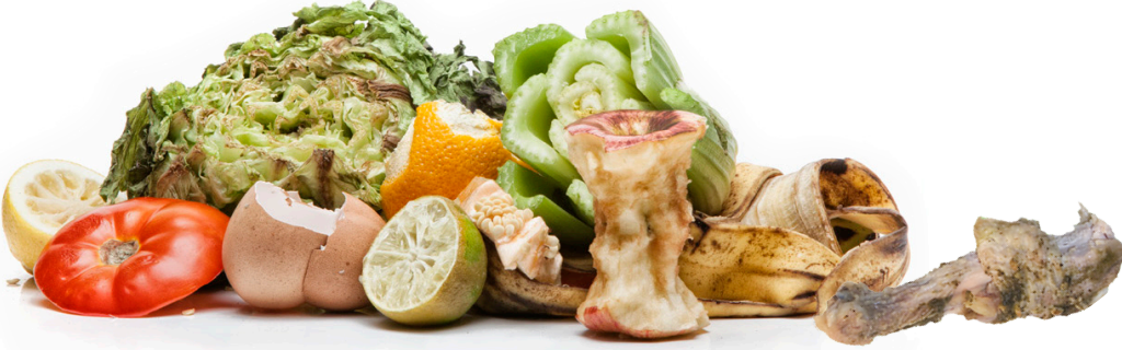
Food Scraps, Including Egg Shells, Meat & Bones

UPDATED: No coated paper (with surface sheen) such as cups, plates or cardboard boxes. No “compostable” plastics.