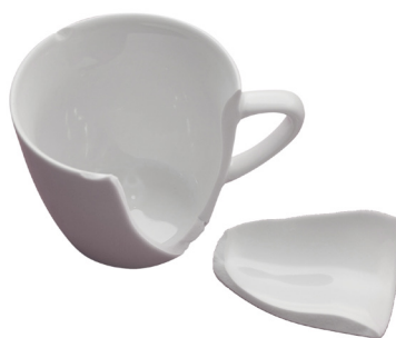
Broken Glass & Dishes (Please Wrap)