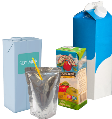
Drink & Beverage Cartons, Boxes / Pouches (Multi-material Packaging)