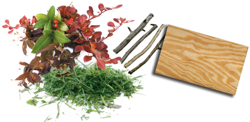
Yard Waste, Untreated Wood