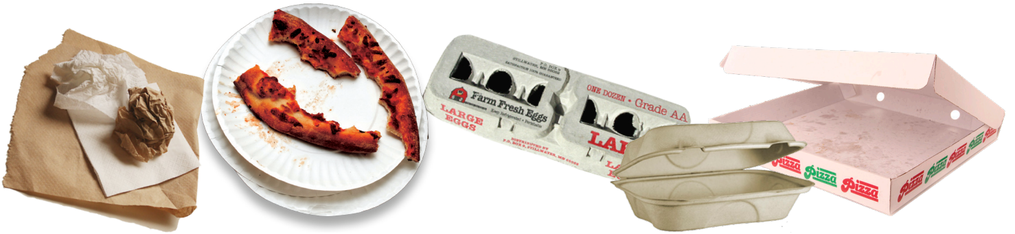
Food Soiled Paper, Napkins, Paper Towels, Pizza Boxes, Cardboard Egg Cartons, Non-coated Take-out Containers & Paper Plates (No surface sheen)