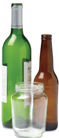
Glass Bottles & Jars (Even broken)