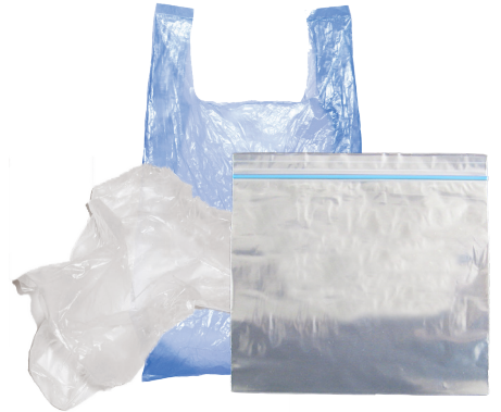
Plastic Wrap, Bags & Other Plastic Film