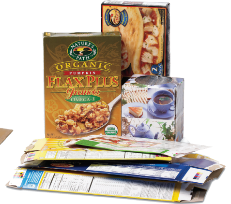
Clean Paper, Magazines, Newspaper, Cardboard, Junk Mail