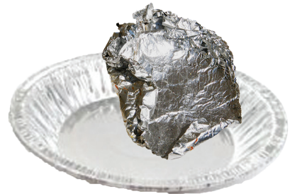
All Metal Beverage & Food Cans, Empty Aerosol Cans, Clean Aluminum Pans & Foil