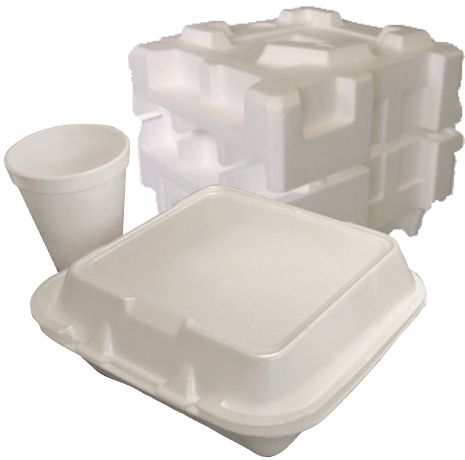
Polystyrene Foam & Packaging