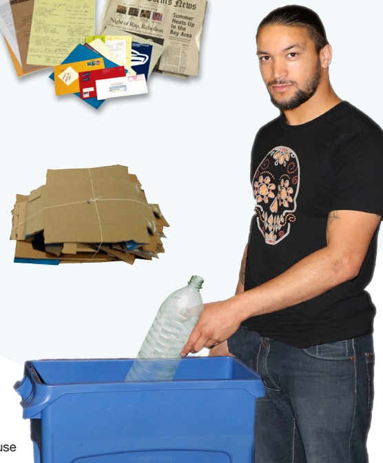
Recycling at Chop House