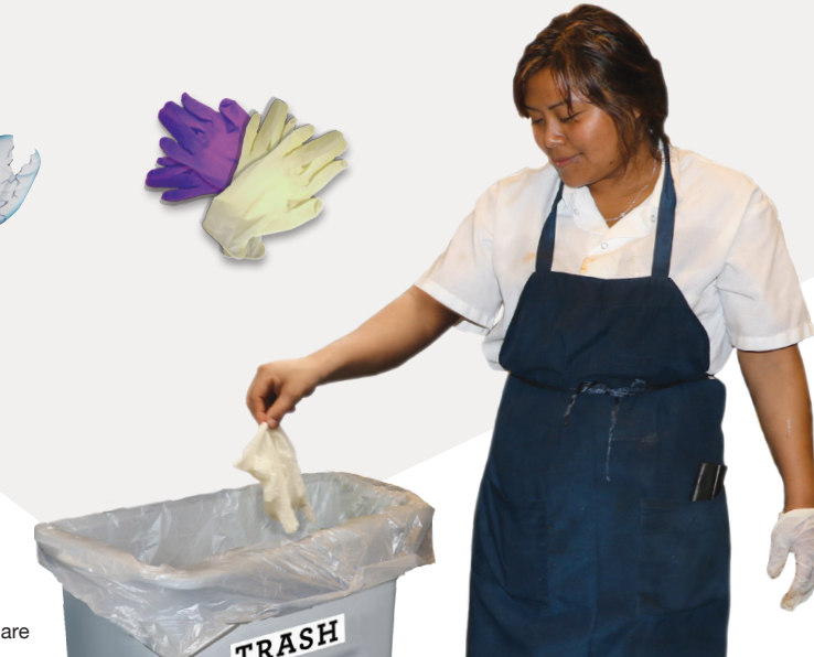
Discarding gloves at Lugomare