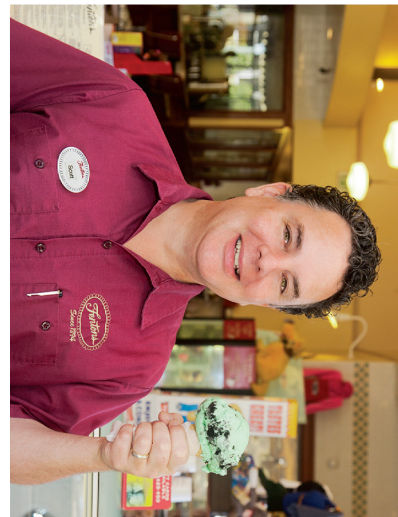
Recycling at Fenton's Creamery

Free Technical Assistance! Call WMAC (510) 613-8700 or email: csnorthbay@wm.com