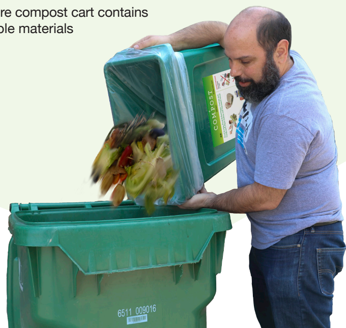
Composting at Calavera