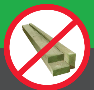
NO Treated Wood