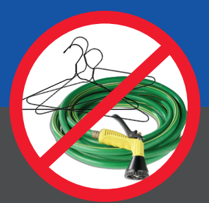
NO Hoses & Wires