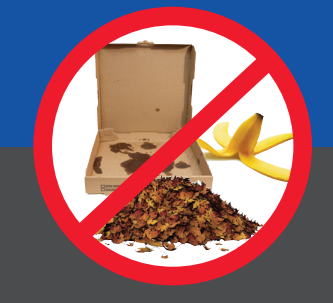
NO Compostable Materials