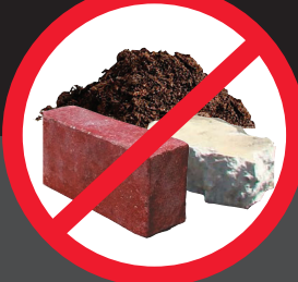
NO Brick, Dirt, or Concrete