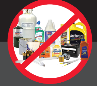
NO Hazardous Waste StopWaste.org/HHW