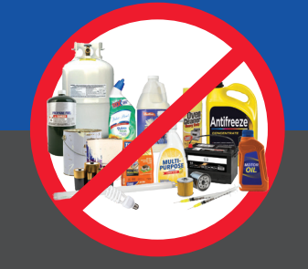
NO Hazardous Waste StopWaste.org/HHW